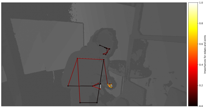
Figure 3: Heatmap of correctly predicted label 5 on depth image.